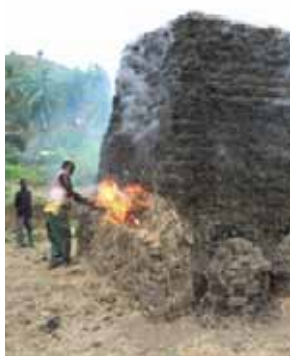
Plates 1 and 2: Brick Burning in Tundu Village; Fuel Efficient Stoves in Iwemba Village

In the roadside villages, such as Tundu and Ruaha, there is an increasing seasonal usage of rice husks as an alternative to firewood in firing bricks for building. This is linked to a growing awareness of the greater efficiency in using husks over firewood. However, the activity is seasonal and there are complaints that the firing process is considerably slower, and less intense, using husks, therefore less profitable. In the hillside villages, there is no use of rice husks because it is not a viable alternative due to the distance from the road and the markets.