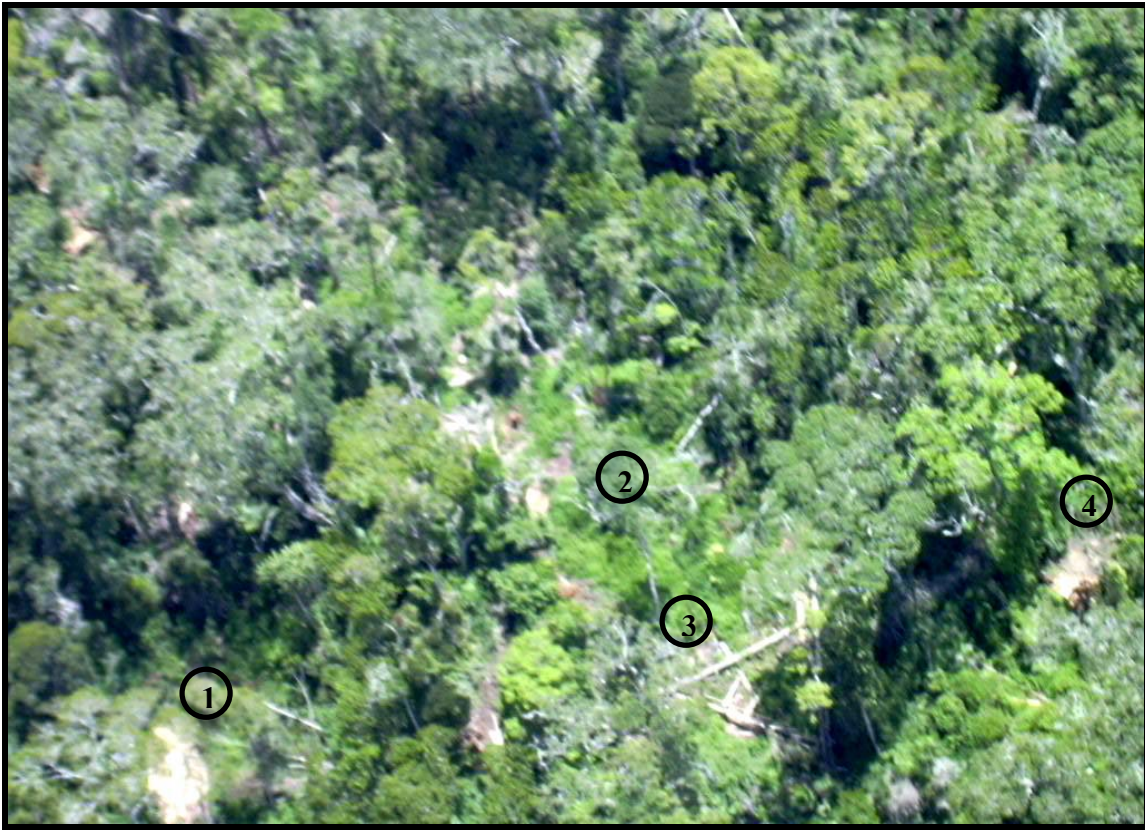
Multiple pit-saw sites at a single location in southern Chome Forest Reserve. This picture is representative of the intense logging situation in the southern part of the forest.

Chome Forest Reserve, a 14,000ha Catchment Forest Reserve in the South Pare Mountains, is under severe threat by illegal logging. CBBP fieldwork conducted over the past year has indicated that the illegal logging situation in Chome has gotten much worse in 2002-2003 compared to earlier in the project lifetime. Indeed, despite its links to FBD and forest-adjacent communities, CBBP has had very little success in changing the logging situation in Chome Forest Reserve since this integrated conservation and development project began in 1998. As plans to draw up a participatory Forest Management Plan for Chome continue to evolve, stakeholders must be aware of the current state of the forest, and how the logging situation affects FMP process (Chome is a catchment forest, where logging activities are strictly banned). A brief summary of information about logging in Chome is presented here in order to shed light on the gravity of the situation, and with the hopes of encouraging the necessary action to stop the destruction of Chome Forest Reserve.