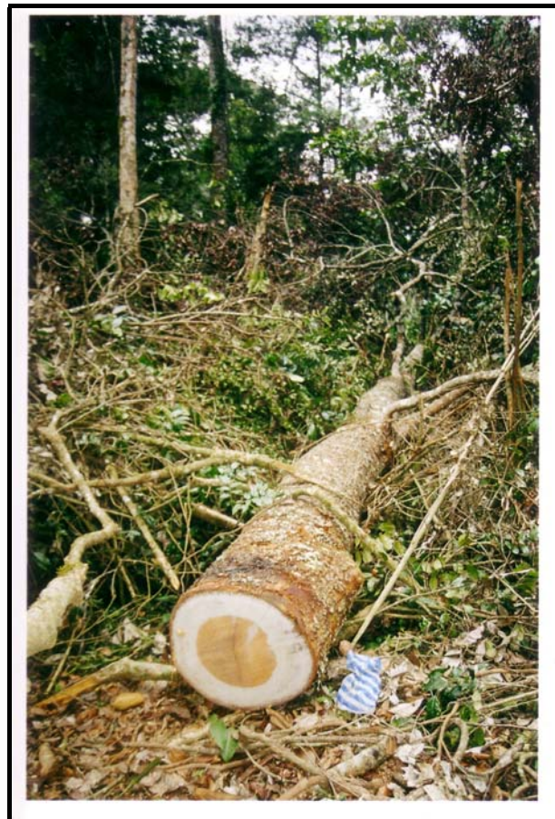
A 61cm diameter Camphor tree cut in June 2003.

On the business side of things, the robbing of Chome's hardwood needs to be made more visible in the media, so that the ensuing negative effects on biodiversity (Chome is in the South Pare Mountains and houses many Eastern Arc endemic species) and water (most villagers around Chome agree that water coming out of this Catchment Forest is less now than in the past) are heard. And the policing should not stop at the forest boundaries. Perhaps the national Police Force could be brought into the loop so that trucks loaded with hardwood along main roads are subject to inspection and confiscation unless proper documents showing the origin and legality of the timber are produced.