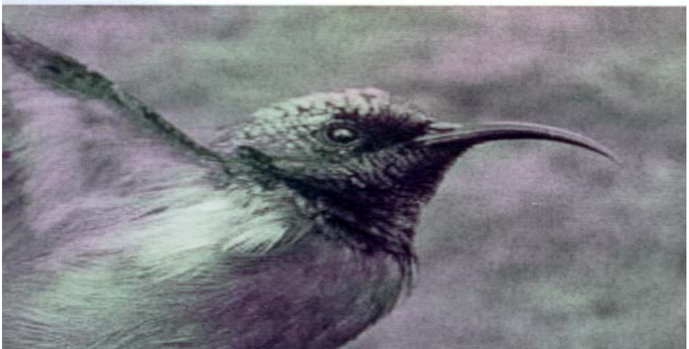
Eastern double-collared sunbird Nectarinia mediocris