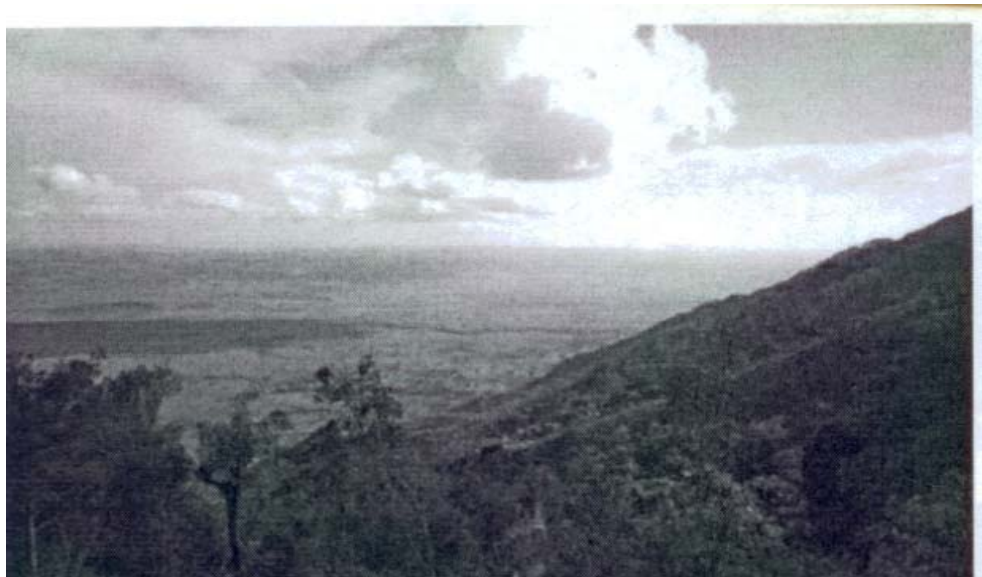
View of Mufindi Scarp Forest Reserve