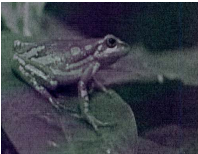
Variable reed frog Hyperolius pictus