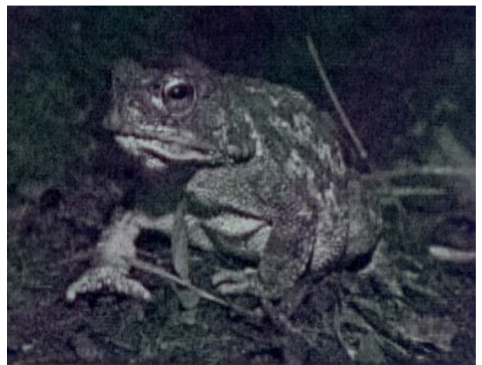
Guttural toads Ametophrynus gutturalis