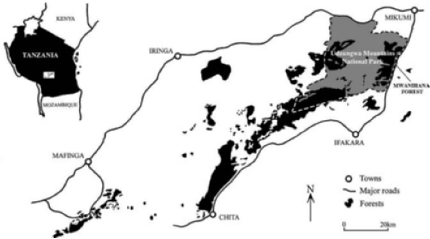
Fig. 1. Map of the Udzungwa Mountains of south-central Tanzania highlighting the main forest blocks (in black) including Mwanihana Forest, and the Udzungwa Mountains National Park (in gray). (From Marshall et al. , 2005).